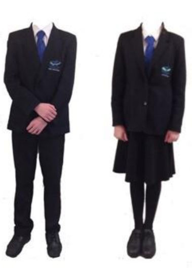
Examples of correctly worn uniform